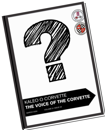
Photo Submissions Welcome

Do you have awesome CCOH Photos? Want your car featured on the cover of next month's newsletter?