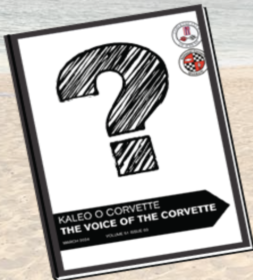
Photo Submissions Welcome

Do you have awesome CCOH Photos? Want your car featured on the cover of next month's newsletter?