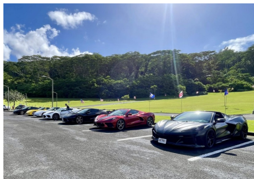
Hawaii State Veterans Cemetery—Kaneohe