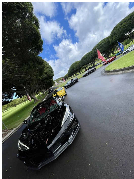
National Memorial Cemetery of the Pacific (Punchbowl)