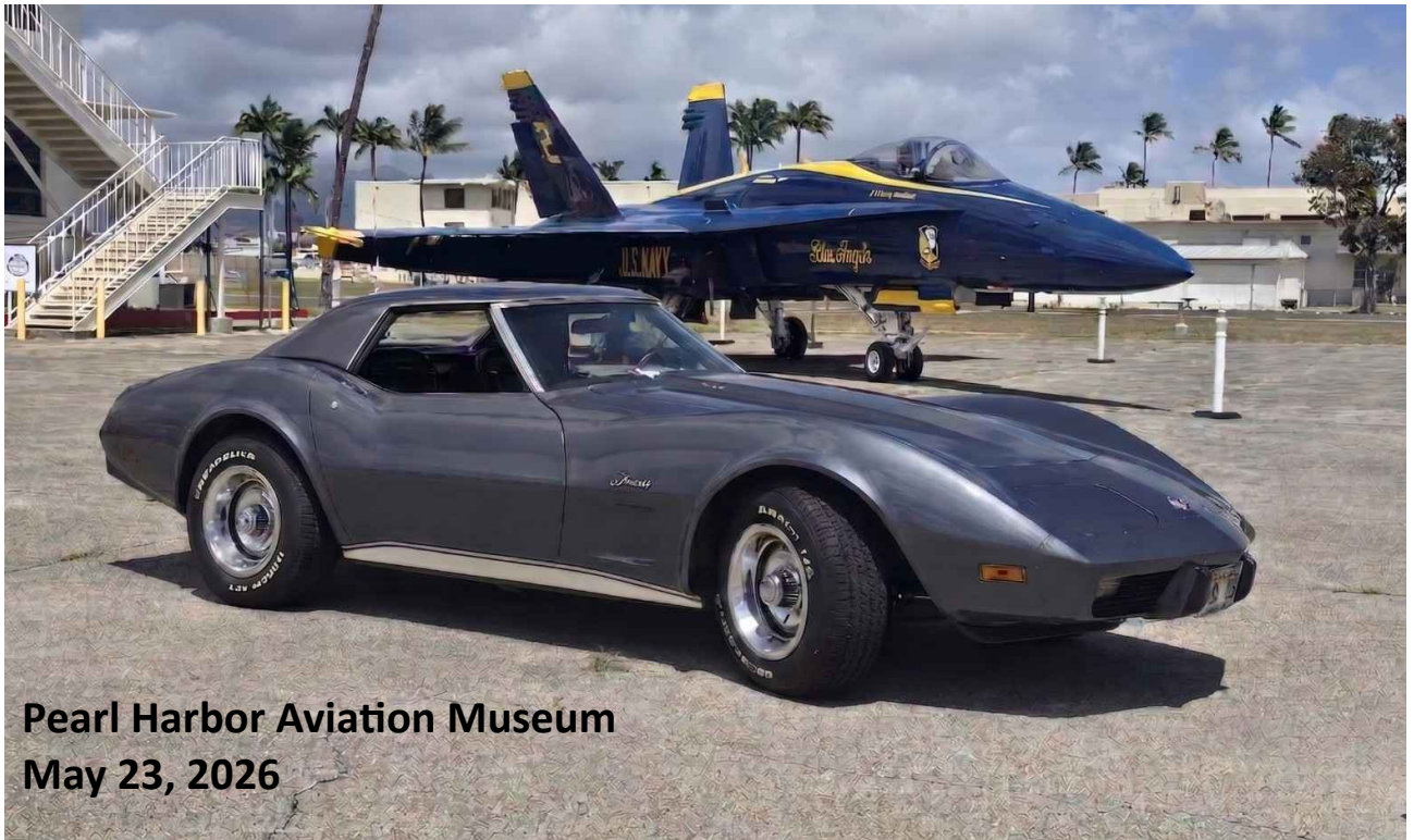
Pearl Harbor Aviation Museum May 23, 2026